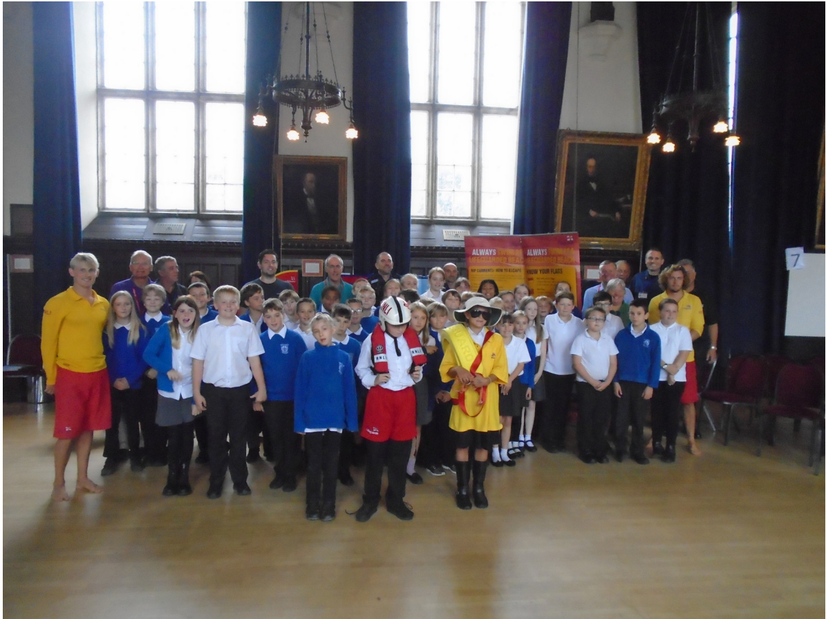
Year Six pictured with the representatives of the Life Skills Workshop in Tavistock Town Hall

Q: Do you think other year groups at Tavistock Primary would enjoy Life Skills?