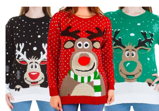
Christmas Jumper Day is on 10th December. Please bring in £1 on this day.