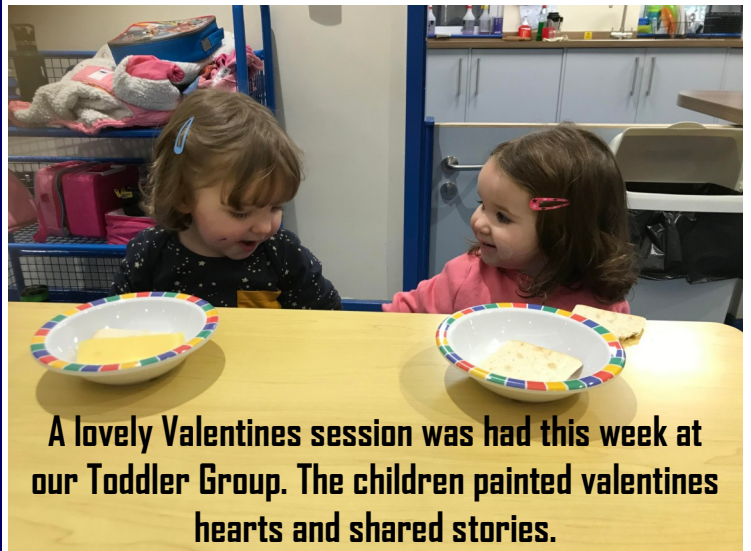
A lovely Valentines session was had this week at our Toddler Group. The children painted valentines hearts and shared stories.

Please remember not to include chocolate or sweets in your child's packed lunch.